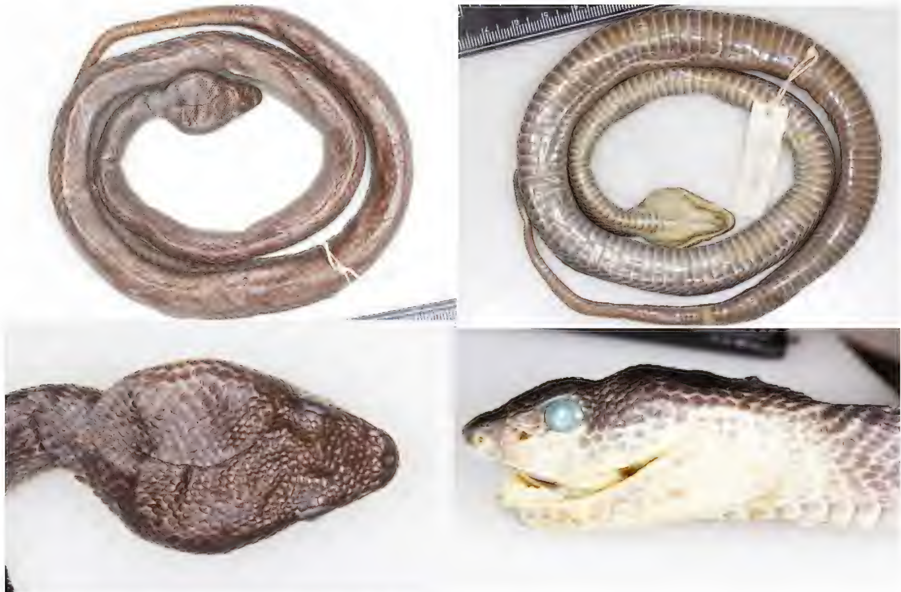
Fig. 1. Holotype (BNHS 3304) of Trimeresurus davidi sp. nov.

of the Department of Ocean Studies and Marine Biology, Pondicherry University (DOSMB), Port Blair, India. Six specimens of this species available in the collections of the Natural History Museum, London (NHMUK), which were collected during Lord Moyné's expedition to the Nicobar Islands (Smith 1943), were examined for comparison. One additional specimen deposited in the collections of the Bombay Natural History Society (BNHS) was studied and ascribed to this species.